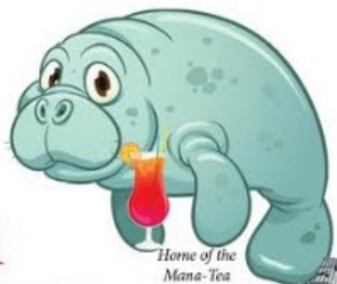
Home of the Mana-Tea