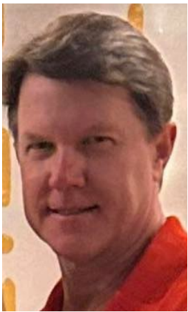
Director at Large